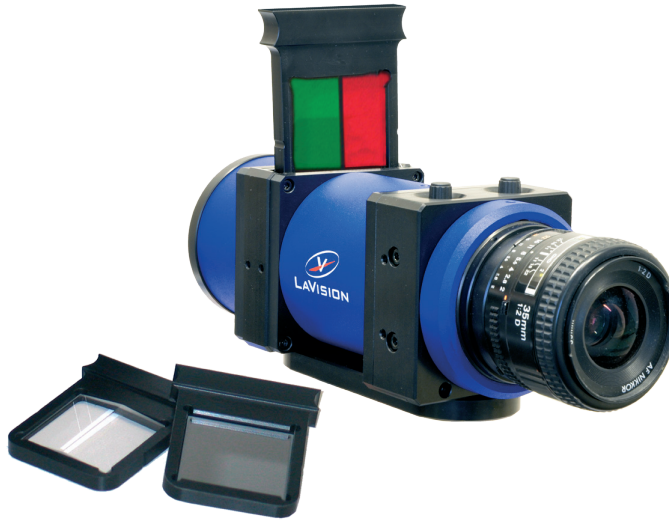
Image Doubler incl. 2 color filter*, separating prism and neutral density filter.

The Image Doubler for Pyrometry provides the projection of an image pair onto a single camera. Additional filters can be mounted for each image separately. It is based on an image separation by a prism inside the optical path, so that parallax errors are minimized. The f-mount front lens can be exchanged by any user specific focal length.